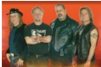
GREAT TRAIN ROBBERY

For the latest, call 443.225.4115 or go to jimmieandsooks.com . 421 Race Street